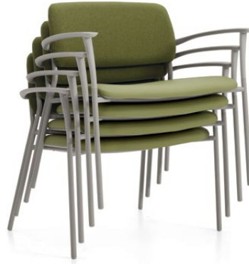
Bariatric armchairs stack 4 high on the floor, 8 high on the dolly