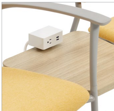
Optional power and USB charging, clamp attachment