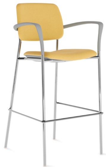
Bar stool with arms, upholstered seat and back

With the exception of the hip chair, all models are available with and without arms. The bariatric chair is available on a sled base and as a hip chair. Backed by Global's Limited Lifetime Warranty, Willow is GREENGUARD Gold and BIFMA LEVEL 3 certified.