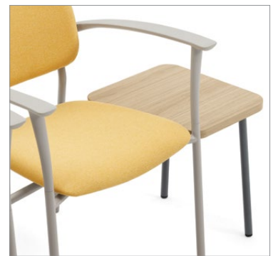
End linking table