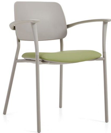
Armchair, upholstered seat and polypropylene back