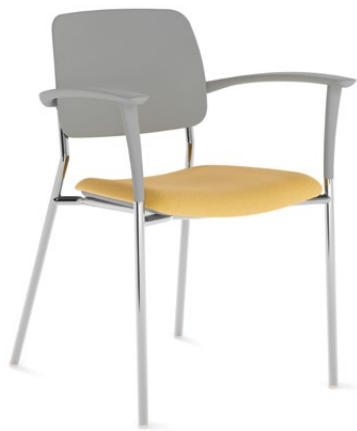
Armchair, upholstered seat and polypropylene back