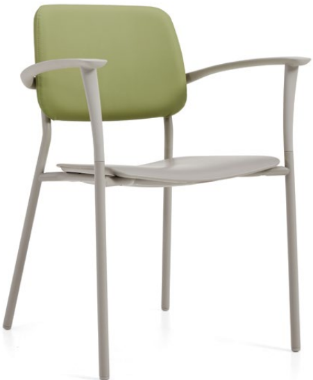
Armchair, polypropylene seat and upholstered back