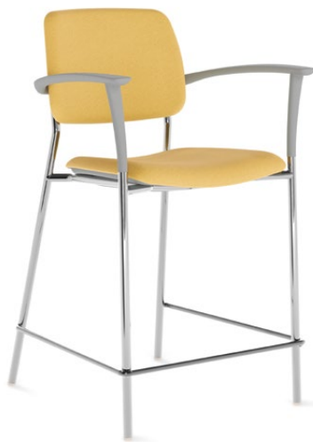
Counter stool with arms, upholstered seat and back