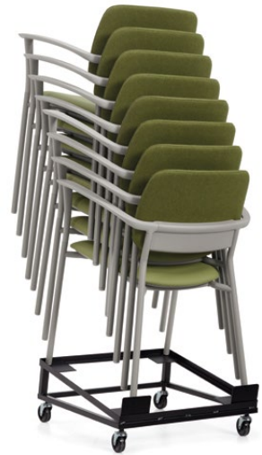
Upholstered armchairs stack 8 high on the dolly Unupholstered armchairs stack 10 high on the dolly