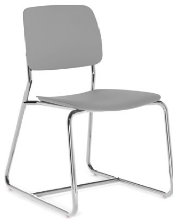
Armless chair, sled base, polypropylene seat and back