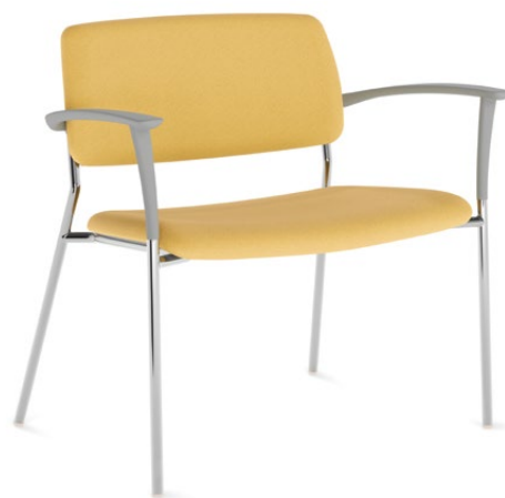
Bariatric armchair, upholstered seat and back