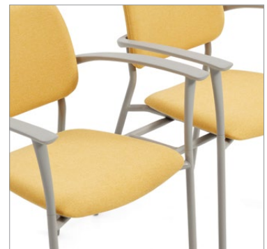
In-line ganging brackets