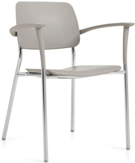
Armchair, polypropylene seat and back