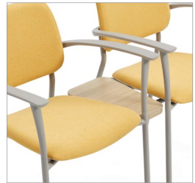
9" in-line linking table

Willow combines comfort and durability with the flexibility of a modular seating series. Individual seats can be joined together with corner, end and in-line linking tables to suit the allocated space and application.