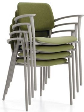
Upholstered armchairs stack 4 high on the floor Unupholstered armchairs stack 6 high on the floor