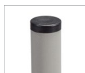
Colored nylon (Black or Sand)