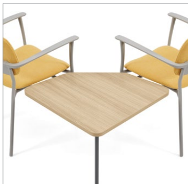
90° corner linking table