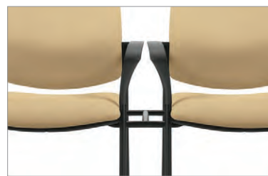
Optional steel ganging clamps easily attach multiple units together to create desired configurations.