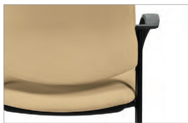
Two piece back allows support brackets to be concealed.