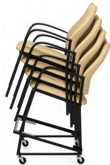
Dolly (2125WS) allows 19.5" seat width models to stack 8 high.