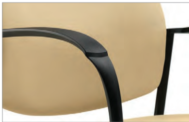
Wide, fully extended arms, available in Black only.