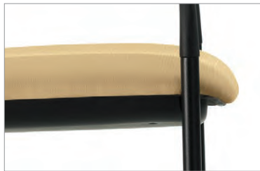
Ultracell BioPlush foam with waterfall seat, ensures maximum comfort (shown with seat shroud).