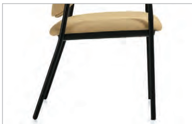
Angled back legs create a wall saver frame. Sled base is also wall saver.