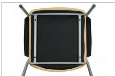
24" and 30" models come standard with vinyl upholstered underside aiding in infection control.