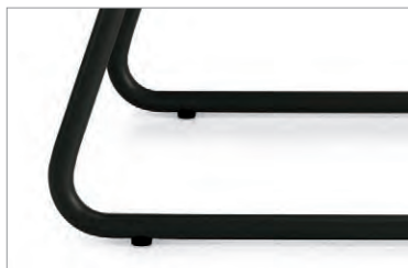
Rugged steel frame.