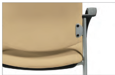
Single piece back with pull-over cover upholstery. Support brackets are fastened on the outer back.