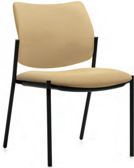
Armless, low back, four-legged