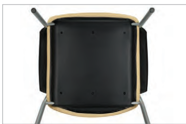
Underside seat shrouds (19.5" models only) help avoid impressions and damage when stacked.