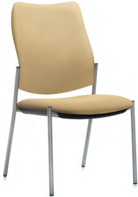
Armless, high back, four-legged